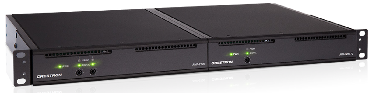
Two 1/2-width units ganged together (ganging kit and rack mounting kit included)