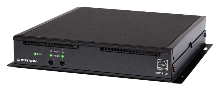
Single 1/2-width unit with surface mounting kit (included)