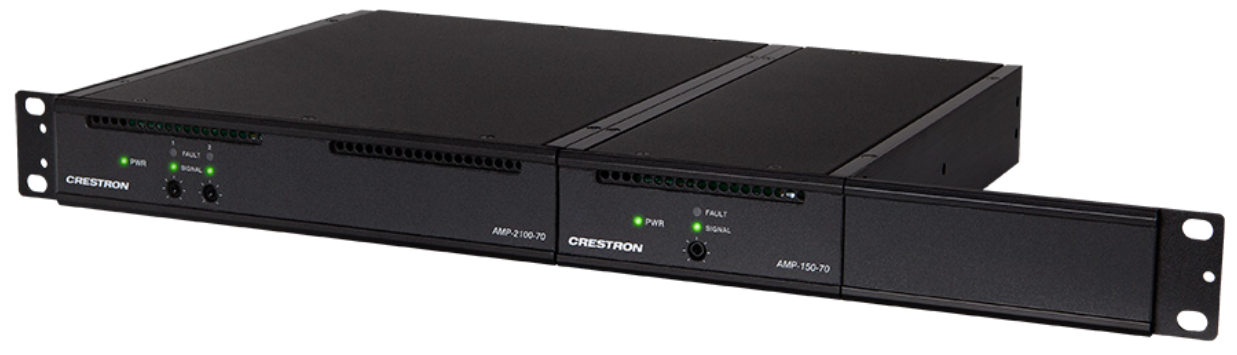
One 1/2-width and one 1/4-width units ganged together (ganging kit and rack mounting kit included)