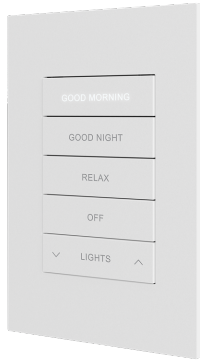
White Shown with Custom Engraving on a Style 1 Button Assembly, Faceplate not included